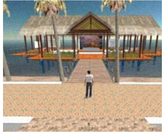
Screengrab of the virtual embassy of the Maldives in Second Life

of American life: capitalism. 9 More specifically, Second Life was centered on what anthropologist Tom Boellstorff first described as “creationist capitalism,” an economic system that reframes labor in terms of creativity and intellectual property. Second Life not only allowed players to create and monetize virtual constructs in a wholly simulated environment, it also allowed users to convert game currency “Linden Dollars” for fiat currency. 10