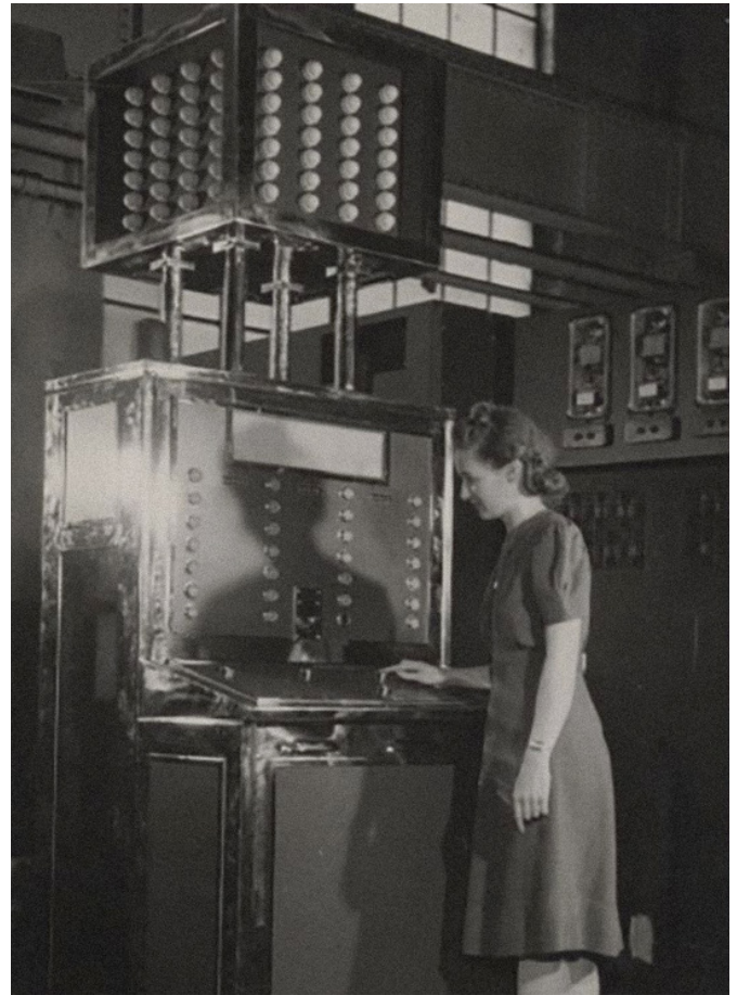
Nimatron at the 1939 World's Fair. Image credit: Westinghouse Electric Co.

When early graphical games like Neverwinter Nights were pulled from the market, it was to make way for new titles with increasingly sophisticated graphics, connectivity, and mobile engagement. More advanced computer processors and graphics processors allowed for the creation of open-world environments, such as in Grand Theft Auto III (GTA III). GTA III, released in 2001, gave users the ability to freely navigate a rich, immersive virtual city, moving beyond the confines of traditional, linear storytelling. 8 Instead of simply prompting users to respond to a predetermined set of decision prompts, GTA III gave users the illusion of self-determination, albeit within the confines of a finite set of missions, bot behaviors, and environments. GTA III's world may have seemed endless to players, but it was an isolated one,