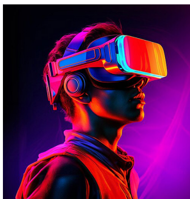
VR headset rendering by Simon Waldherr

must take steps to protect players from the additional types of information tracked by gaming systems. End users often have far less control over AR and VR systems and privacy settings than with traditional computers, linking every element of their digital life with their real-world identity. As gaming-based ad tracking eviscerates the last remnants of anonymity and autonomy, in both digital worlds and real life, the price of continued inaction on privacy protections will become intolerable.