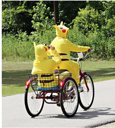
Pokemon Go fest in Kenosha, Wisconsin (left) and Roman Forest, Texas (center).

Smartphones may be able to handle an array of digital tasks deftly, but they are profoundly limited in how they navigate augmented reality. Phones simply don't have a form factor conducive to AR. Walking the world with a phone held high simply isn't comfortable for many users, and looking at a phone screen can make it harder for users to pay attention to the real-world environment. This was acutely true for Pokémon Go users. Not only did the app lead to billions of dollars of damages in road accidents, 69 but it also led to some users' deaths. 70